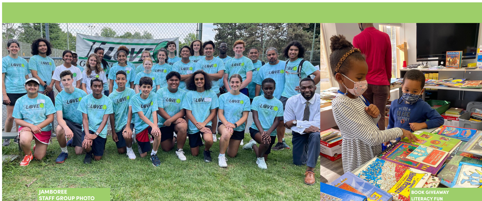
JAMBOREE STAFF GROUP PHOTO