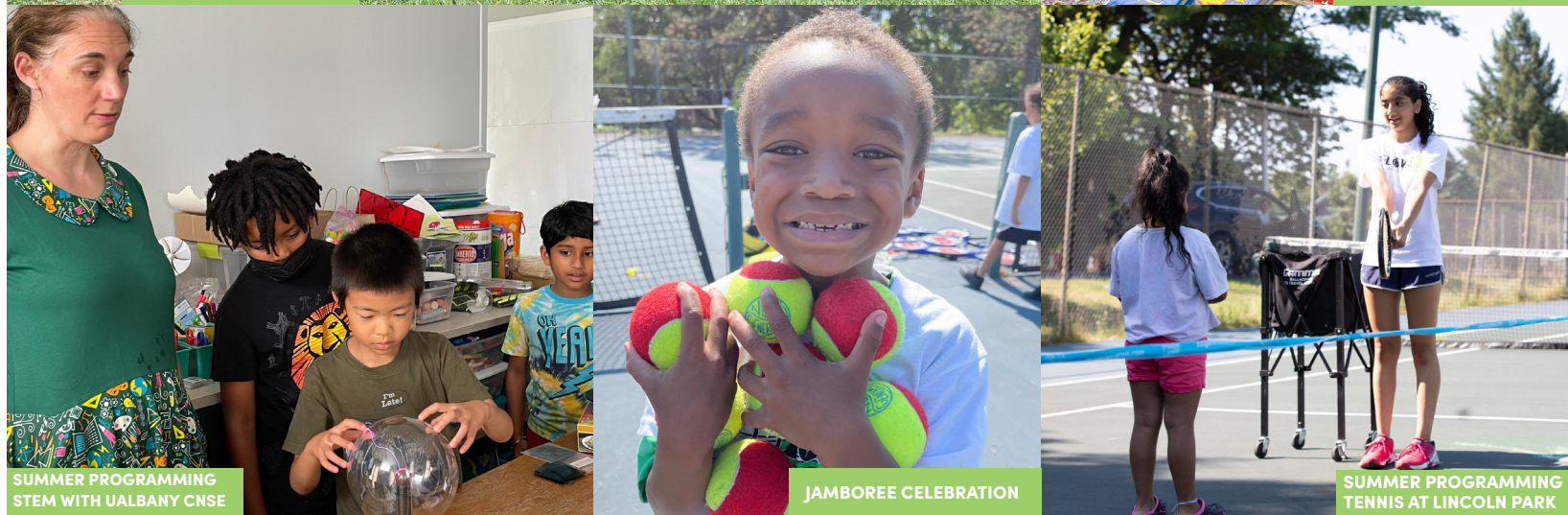
SUMMER PROGRAMMING STEM WITH UALBANY CNS