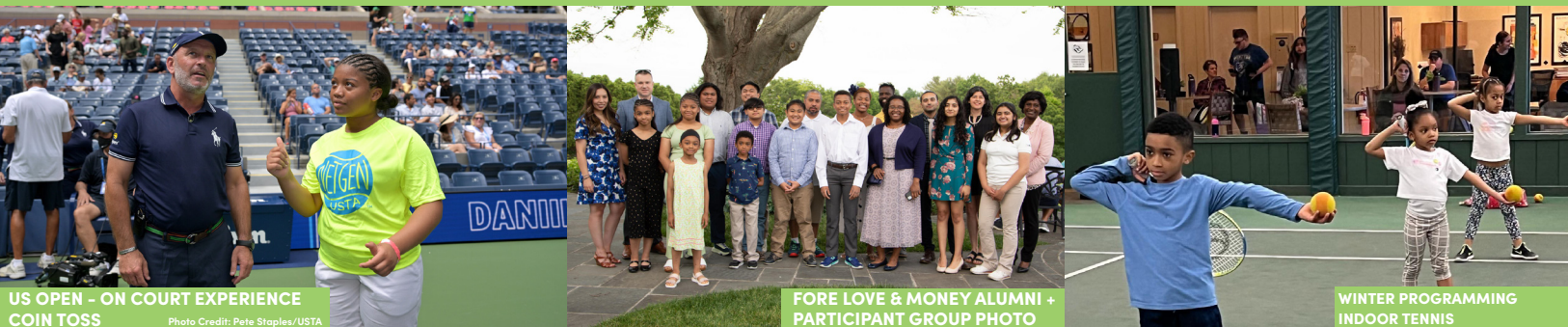
US OPEN - ON COURT EXPERIENCE COIN TOSS