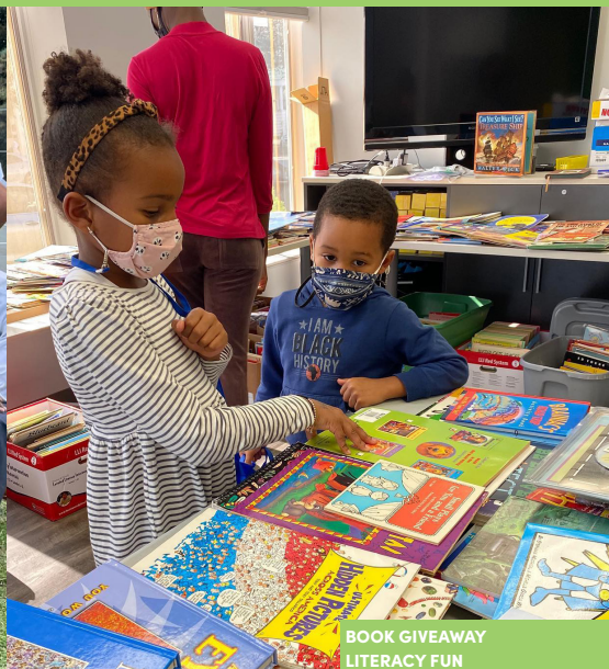
BOOK GIVEAWAY LITERACY FUN